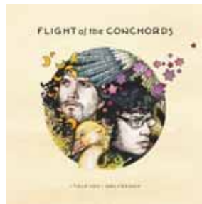
I Told You I Was Freaky Flight of the Conchords Stomp

Lightning Bolt has played stages around the globe. Touring November.