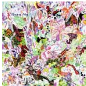
Earthly Delights Lightning Bolt Stomp

A fuller, richer sound than any of the artist's previous releases, as Robbie unashamedly pays homage to some of his musical heroes. The Pet Shop Boys connection, which began with Neil Tennant's backing vocals on No Regrets and continued on Rudebox's cover of We Are The Pet Shop Boys , is evident here again on Last Days Of Disco and, most especially, on Difficult For Weirdos . Album released November 6.