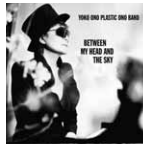
Between My Head & the Sky Yoko Ono Stomp

At 76 years young, Yoko continues to kick ass. This record, made with her new Plastic Ono Band, is a gorgeous, mind-melting blend of styles, restating and sharpening themes while plunging into the always-mysterious future.