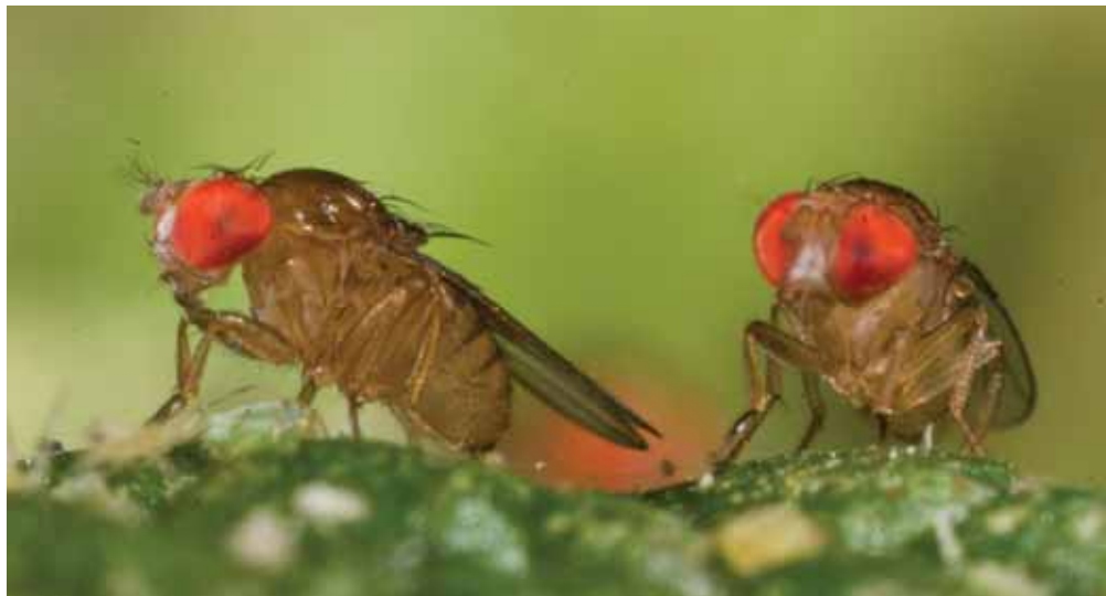
Photo of Drosophila melanogaster and Drosophila birchii.

The work was conducted by a team of Melbourne and Monash University researchers from CESAR, and will be published in the journal Science .