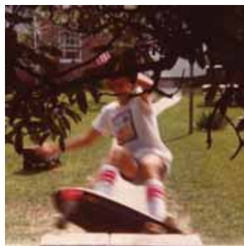
Wavves Wavvves Stomp

The band will return to Australia in early November 2009 for a National tour.