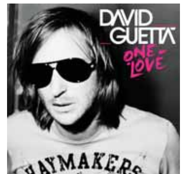
David Guetta One Love EMI Music