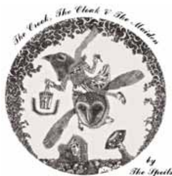
The Spoils The Crook, The Cloak & The Maiden Stomp

Kings & Queens is full of the gutter poetry, anger and humour of the first album. But tougher, more focused, more confident, and with even better tunes.