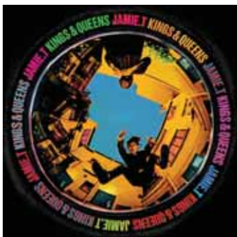
Jamie T Kings & Queens EMI Music

As formulas for beating Second Album Syndrome go, the Jamie T solution could catch on. Because his second album, Kings & Queens , sounds like the work of a veteran who would much rather look at the world outside than fret about his career. Yet, on the other hand, it’s an album pulsing with the energy and vibrancy of youth. It also unveils, on several tracks, Jamie T... the accomplished singer.