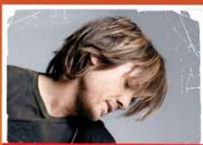
ONLY VICTORIAN APPEARANCE